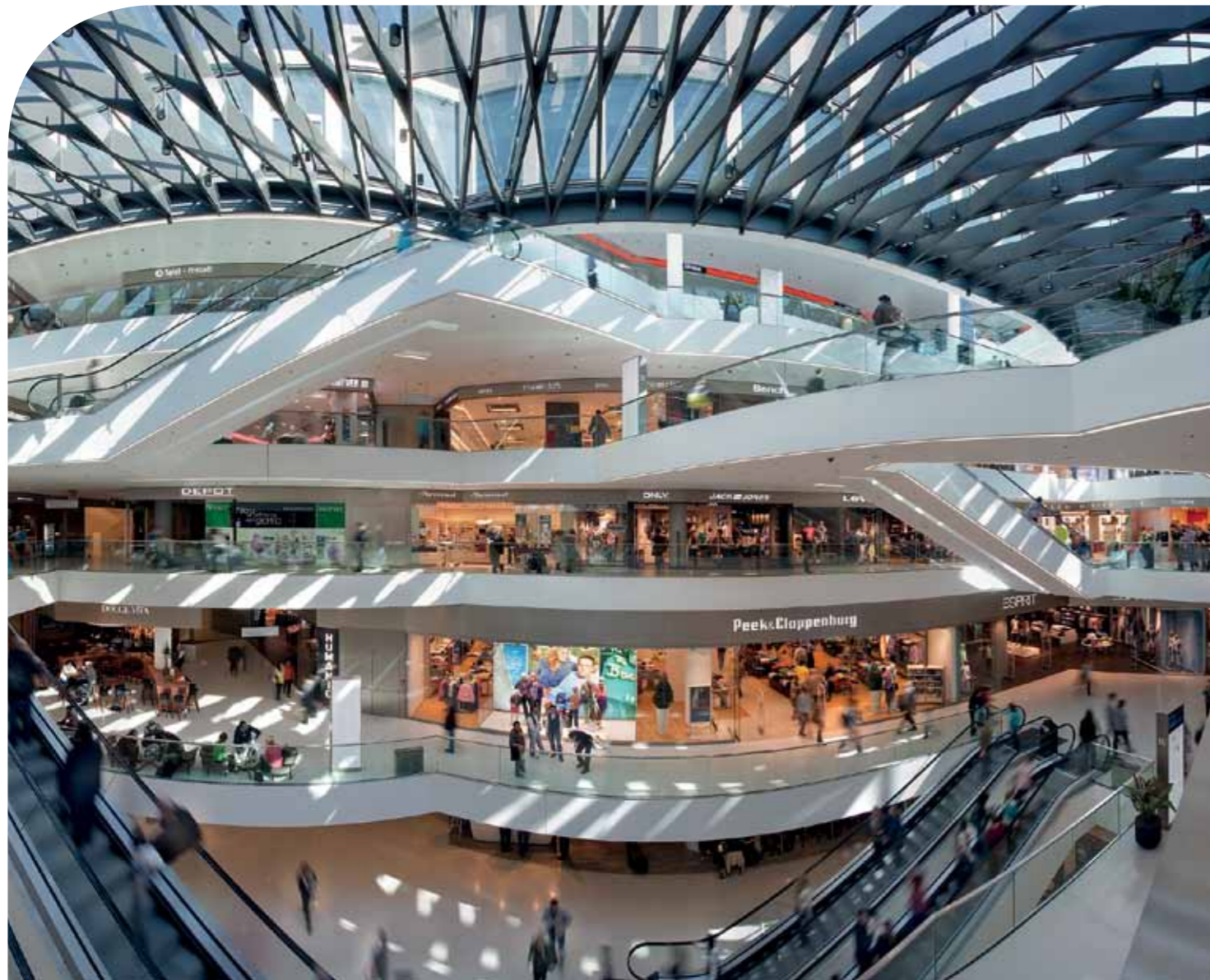
The Kaufhaus Tyrol, redesigned by the star architect David Chipperfield, opened in March 2010 in the heart of Innsbruck.

In Austria, shopping center development is heading toward optimization and expansion of existing locations. Nevertheless, two prominent new projects were opened this year: Varena in Vöcklabruck and Riverside in Vienna.