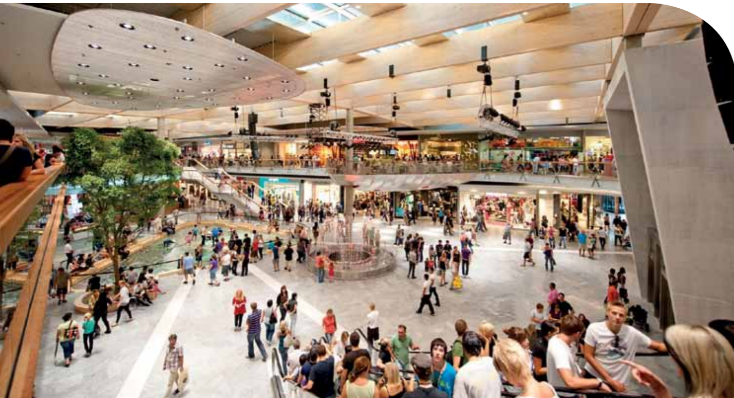
SES' Varena draws attention with attractions like a walkable map and a fountain with a waterfall reaching down to the underground garage levels. The center of the mall is a 2,000 sq m area, the so-called Plaza, framed by shops, cafés, and restaurants.

According to SES CEO Marcus Wild, SES is seriously considering expansion of three of their sites in Austria. The centers recording the highest productivity will be expanded in the next two to four years. One of these, Wild says, is the very successful and internationally recognized Europark in Salzburg. According to SES, in 2009 this center was ahead of all other Austrian shopping centers for the twelfth time in terms of productivity with € 8,865 turnover per square meter of sales floor. Concerning the general development of shopping centers in Austria, Wild believes that we will not see many more new locations, but expansion of existing centers could possibly double. Varena was developed on the premises of the previously existent Interspar hypermarket.